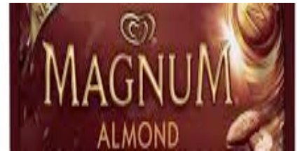
The influence of the Latin and Ancient Greek languages are all around today

The course aims to teach a foundation level in Latin language, focusing on grammatical and etymological (word root) understanding to support English language and literacy, as well as underpinning current and future foreign language learning.